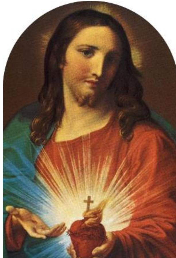
FEAST OF THE SACRED HEART June 23