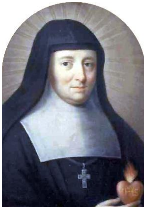
SAINT JANE FRANCES DE CHANTAL

New bulletin announcements and prayer requests must be submitted by noon on Wednesday to be included in the following Sunday bulletin. Send to SMAbulletin@yahoo.com or call 314-302-6433. All requests subject to parish priest approval.