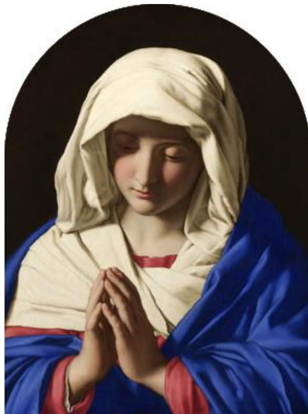
NATIVITY of the BLESSED VIRGIN MARY September 8

New bulletin announcements and prayer requests must be submitted by noon on Wednesday to be included in the following Sunday bulletin. Send to SMAbulletin@yahoo.com or call 314-302-6433. All requests subject to parish priest approval.