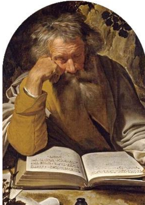
SAINT ANDREW November 30

New bulletin announcements and prayer requests must be submitted by noon on Wednesday to be included in the following Sunday bulletin. Send to SMAbulletin@yahoo.com or call 314-302-6433. All requests subject to parish priestapproval.