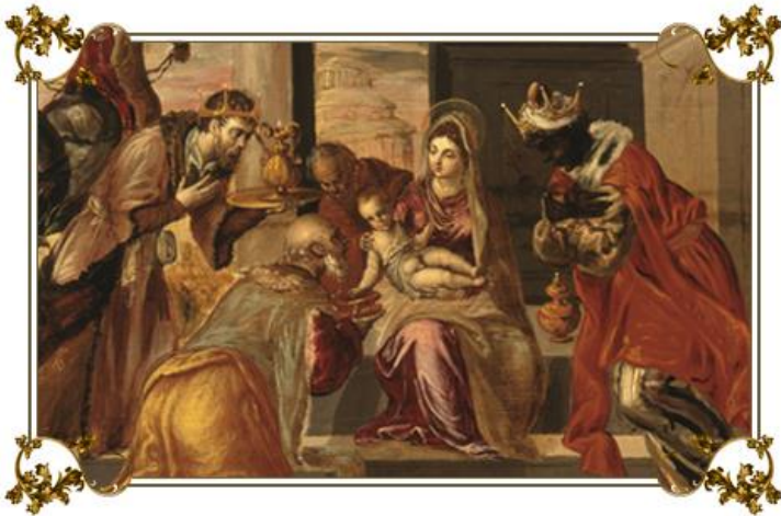
THE EPIPHANY OF OUR LORD January 6

T HE MYSTERY of the Christ-birth is a rich and glorious beginning, splendid with promise. Today we worship a partial fulfillment when Jesus, as an Infant King, is manifested to wise men of the Gentile world and through them to all peoples. His royalty is neither frightening nor pompous, for the kingly majesty of the sovereign Redeemer is robed in babyhood. Coming in the simplicity of true greatness, Jesus makes himself acceptable and at home to the little and the great of every nation under heaven.