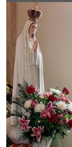
Apr 15 – 21: George Apr 22 – 28: Koch